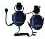
Intrinsically Safe Hamlet Heavy Duty Noise-cancelling Headset kit