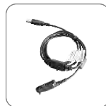
Programming cable PC155