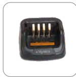
MUC Rapid-rate Charger