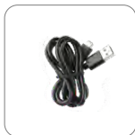
Data cable PC143